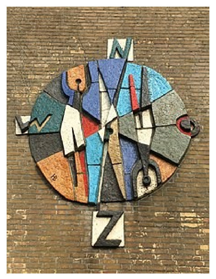
Wijkcommissie Kerkakkers, your compass in the neighbourhood

You can find them next to our publication boards.